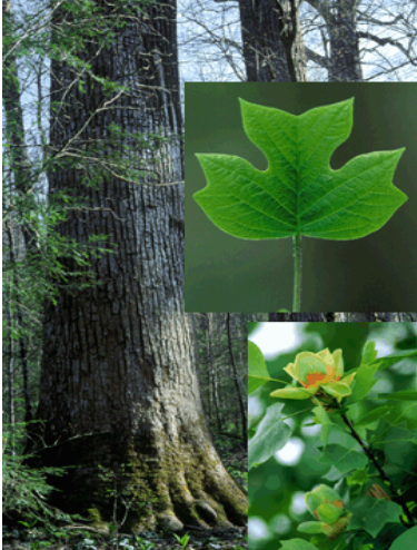
Yellow-Poplar (Tulip-tree), Liriodendron tulipifera . Indiana's State Tree

Santa Claus is located 140 miles south of Indianapolis, IN and 65 miles west of Louisville, KY off I-65. (see map on registration form)